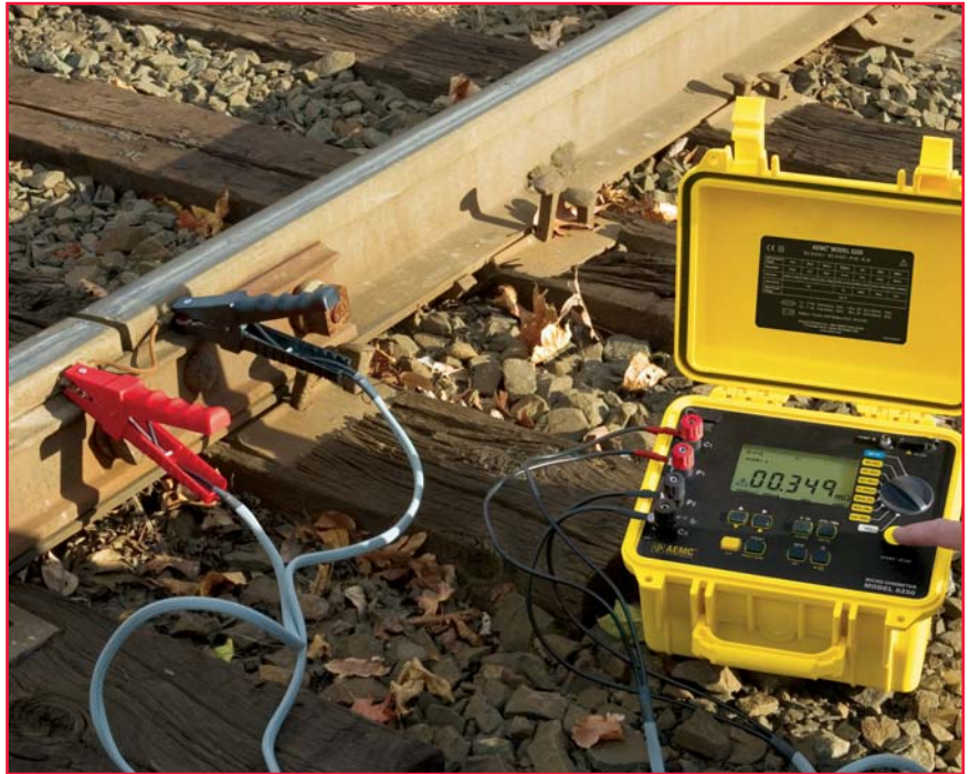
Verifying rail bonds with the Model 6250