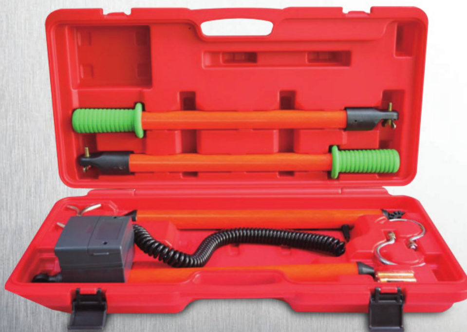
• Carry case (TOC-MDP50K)