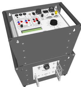
PCU1-SP and NLU5000

Where higher currents and powers are required for primary injection, 11kVA and 20kVA primary injection systems are available. The PCU1-SP and PCU2/E systems have separate control and loading units, allowing a wide range of load conditions to be covered with different loading units.